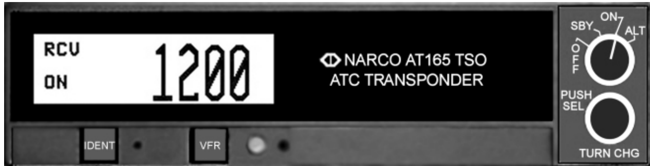
FIGURE 1-1 AT 165 FRONT PANEL